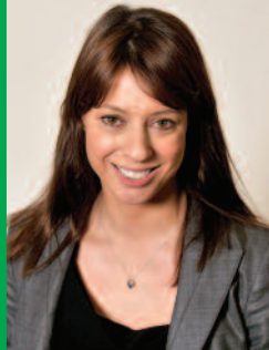
Gloria de Piero MP Ashfield