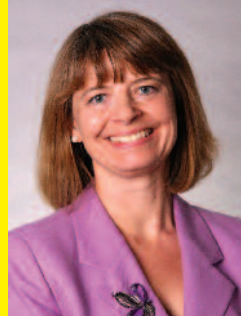
Harriett Baldwin MP West Worcestershire

Visit http://carersweek.org/parliamentary/mps-who-support-carers to read the statements of support from MPs who have responded to our call for them to express their support for carers and Carers Week. Pictured are the first four MPs to support Carers Week 2011.