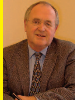
Sir Alan Beith MP Berwick-upon-Tweed

Write to your MP at the House of Commons, Westminster, London SW1A 0AA. Or email them via http://findyourmp.parliament.uk