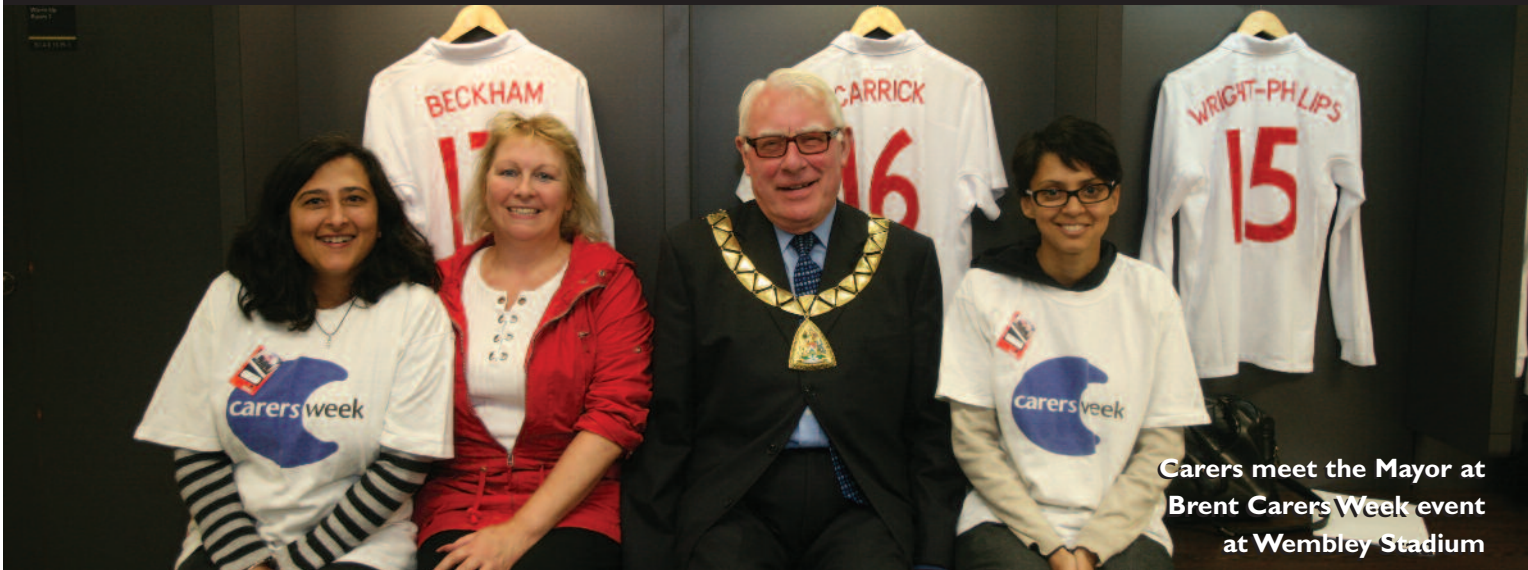
Carers meet the Mayor at Brent Carers Week event at Wembley Stadium