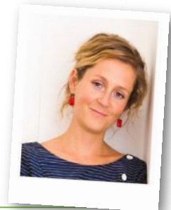
Martha Lane Fox, UK digital champion