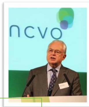
Martyn Lewis, Chairman NCVO