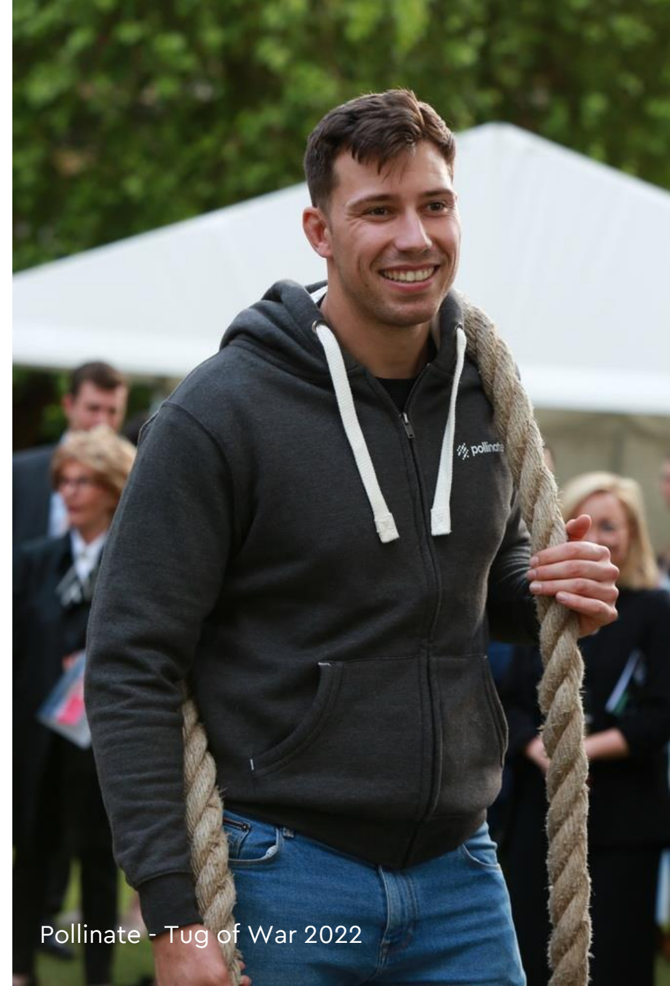
Pollinate - Tug of War 2022