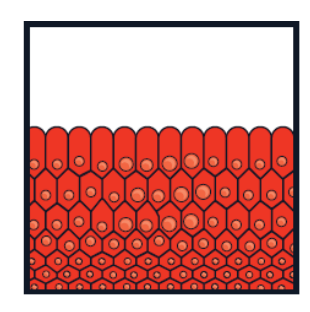
Cells forming a tumour