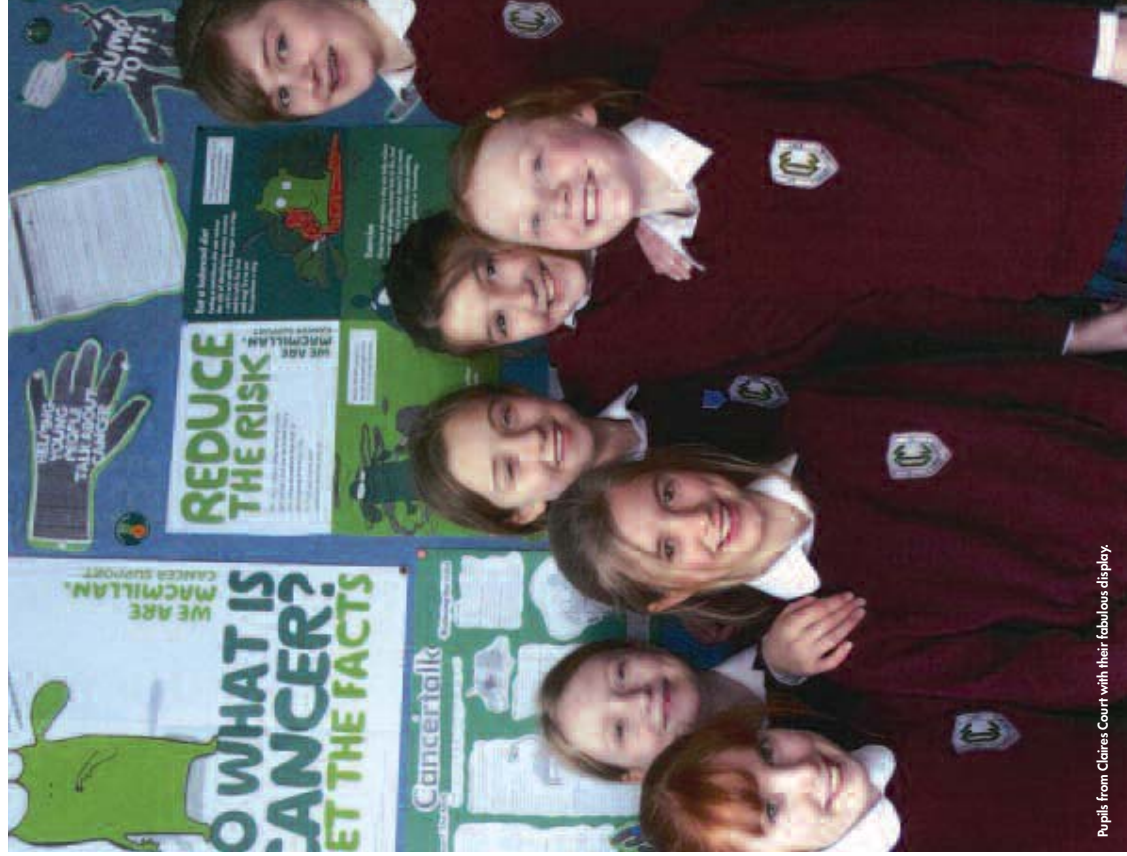
Pupils from Claires Court with their fabulous display.

For more information on any of the above, visit macmillan.org.uk/schools