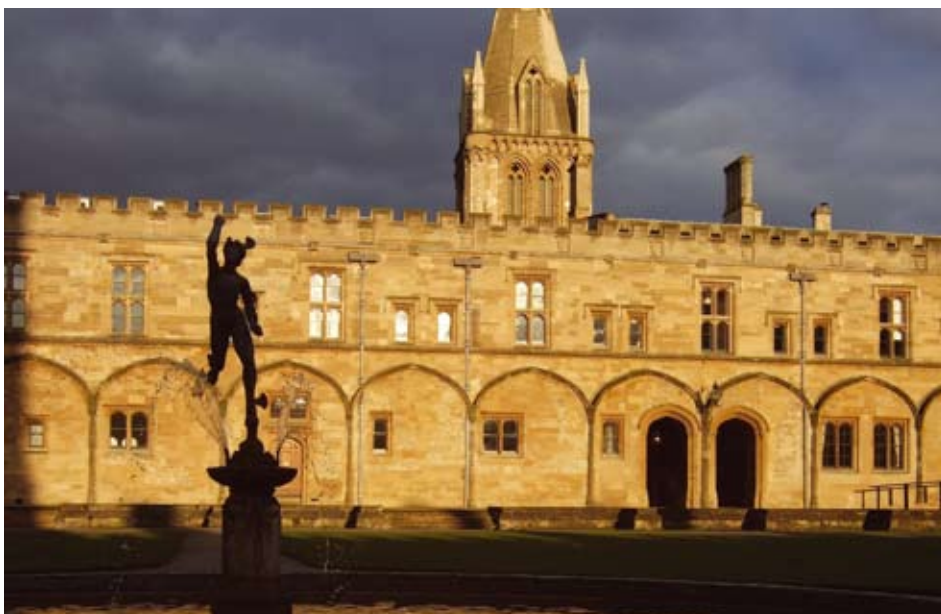
Christ Church Cathedral

cancer by encouraging everyone in your school, company or group to make a donation to Macmillan instead of sending Christmas cards. We will send you a collection box and festive poster to write your greetings on. Call 01908 565963 or 01869 322279.