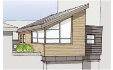
Artist's Impression of the Mustard Tree as it will look following extension of the existing facilities, due for completion September 2009.

In Portsmouth, a similar service continues to see great support from the local community, not just in donations, but in the time they volunteer. Benefits Advisor, Anita Muff said: 'Volunteers are vital to the smooth running of the centre. We are