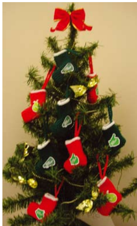
Knitted stocking decorations